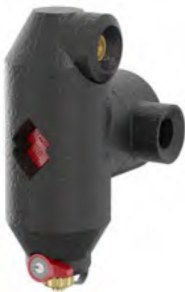
Flamcovent Clean Smart EcoPlus Insulation Pack

The Flamco Smart series Insulation Pack increases energy efficiency by reducing heat loss from the Smart separators