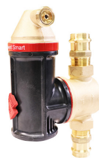
Flamcovent Clean Smart Air Separator Press