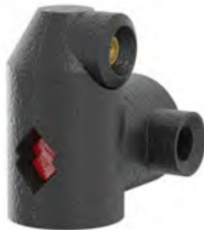
Flamcovent Clean EcoPlus Insulation Pack