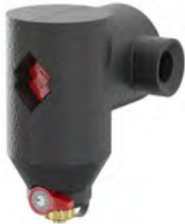
Flamco Clean Smart EcoPlus Insulation Pack