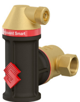
Flamcovent Smart Air Separator NPT