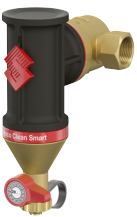
Flamco Clean Smart Magnetic Dirt Separator NPT