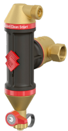
Flamcovent Clean Smart Magnetic Air / Dirt Separator NPT